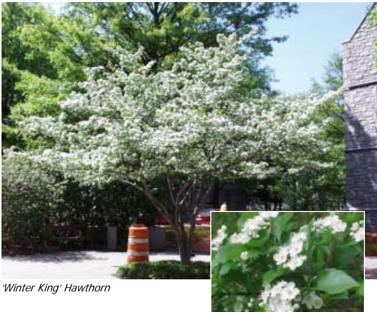
'Winter King' Hawthorn

'Winter King' Hawthorn ( crataegus viridis 'Winter King'): 20' tall; 25' wide; white flowers that form against green leaves; fruits heavily when young and retains fruit throughout winter; vase mature form; medium growth rate; turns reddish-purple in fall; does well in many types of soil; zones 4-7