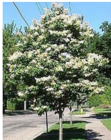
Japanese Tree Lilac

Japanese Tree Lilac ( syringe reticulata ): 20' tall; 15' wide; large creamy white flowers in June/July; oval-rounded to vase-shaped crown form; needs at least 6 hours of direct sunlight per day to produce flower buds; needs well-drained soil; medium growth rate; reddish-brown, cherry-like bark, and clean, dark green leaves; zones 3-7