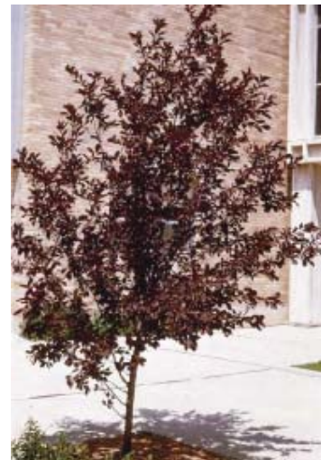
'Canada Red' Chokecherry

'Canada Red' Chokecherry ( amelanchier ): pyramidal to oval-rounded form; 20-30' tall; 15-20' wide; white flowers produced with the leaves in spring; reddish-purple fruit in summer that attracts birds; full sun; adaptable to most soils and pH; needs well-drained soil; tolerant to drier soils; intolerant to poorly drained, compacted soil; sensitive to road salt