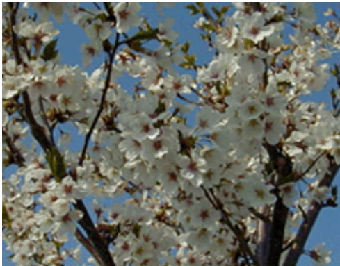
'Snow Goose' Cherry

'Snow Goose' Cherry ( prunus 'Snow Goose' ): 25' tall; 20' wide; foliage is green featuring showy white, early spring blooms; prefers moist soil, tolerates clay; zones 5-8; rounded, upright form