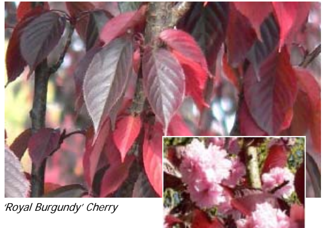
'Royal Burgundy' Cherry

'Royal Burgundy' Cherry ( prunus serrulata 'Royal Burgundy' ): 20' tall; 15' wide; large clumps of pink, double fragrant blooms are framed by the deep purple leaves in spring; in fall the leaves retain their purple, and many turn red as the mobile pigments leave the move down the tree; susceptible to sun scald if stressed by drought, so irrigation should be scheduled during the dry season; zones 5-8; upright vase, oval form; moderate growth; sand, loam soils; pH: acidic, alkaline