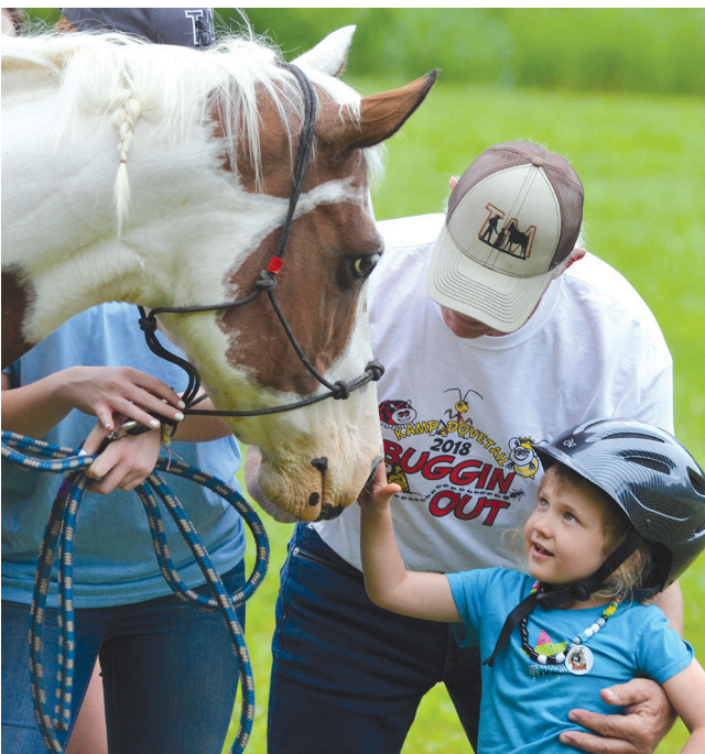
Children with disabilities in Highland and surrounding counties enjoy fun activities at the volunteer-run KAMP Dovetail at Rocky Fork State Park in Hillsboro thanks to financial assistance from grants like ones from South Central Power Company Foundation.

If you need assistance, know someone who needs help, or want to learn more, visit the organization’s website at www.bottomsup.life .